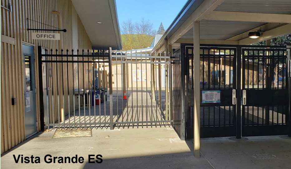
Vista Grande ES