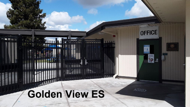
Golden View ES