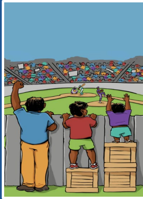
Equity Everyone gets the support they need.